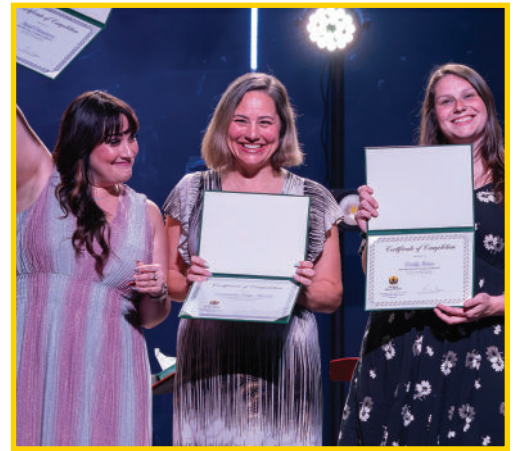
89% of female graduates of our New Life Program from the last five years remain addictions-free and housed.

Your partnership in 2024 helped provide life-transforming support to thousands facing homelessness and addiction in our community. By meeting people where they are in their time of need, we offered compassionate care through personalized, integrated services, including Christian discipleship, life skills training, and addiction recovery. Portland Rescue Mission is 100% community-funded by people like YOU. All our services are free of charge for those in need. Transformation happens every day at Portland Rescue Mission. Thank you for your continued generosity and partnership.