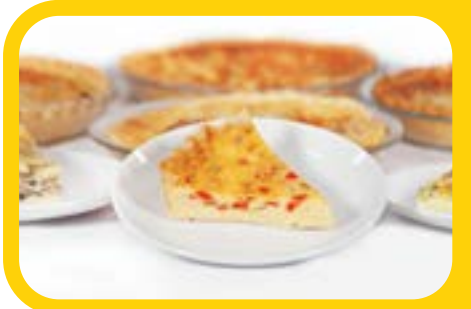
Red Pepper Quiche

Learn more about how Fresh Start Catering can meet all your catering needs while supporting the work of Portland Rescue Mission by visiting www.FreshStart.Catering . Don't forget to sign up for a 10% coupon while you're there.