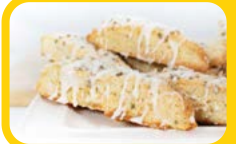
Lavendar Lemon Scones