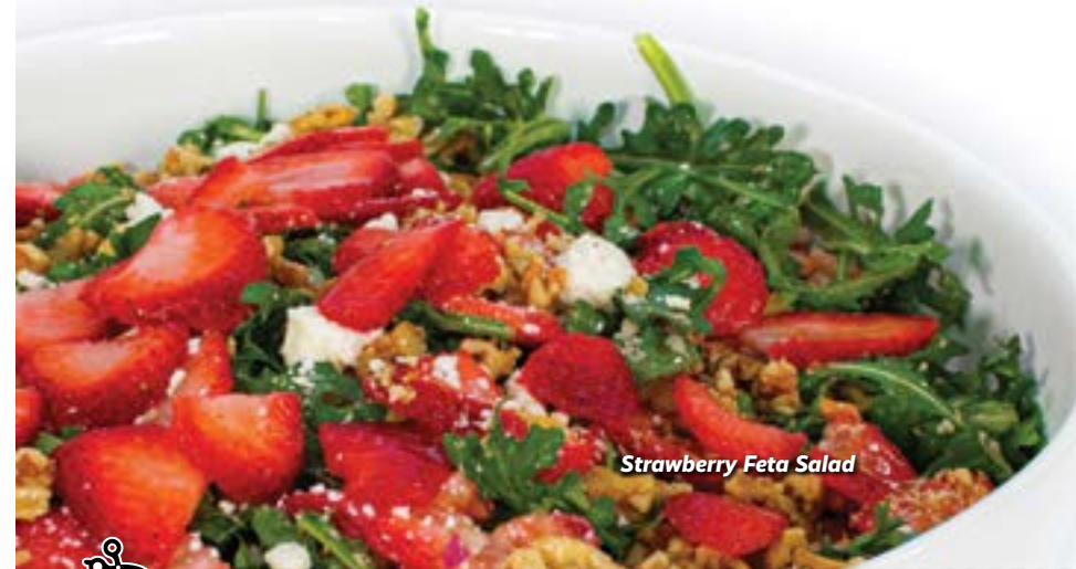
Strawberry Feta Salad