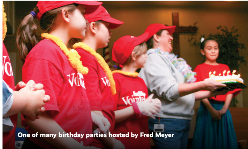
One of many birthday parties hosted by Fred Meyer

Since 2018 The Kroger Co.'s Zero Hunger | Zero Waste Foundation has been committed to creating communities free of hunger and waste. Their commitment to provide nutritious meals while also serving men and women experiencing homelessness, who want to gain skills, stabilize their lives, and find permanent housing, very much aligns with the work of Portland Rescue Mission. For that reason, Portland Rescue Mission received a grant from the foundation that provided nutritious meals to people in need for the entire month of April! This has created thousands of opportunities for us to meet our guests and invite them into a caring community.