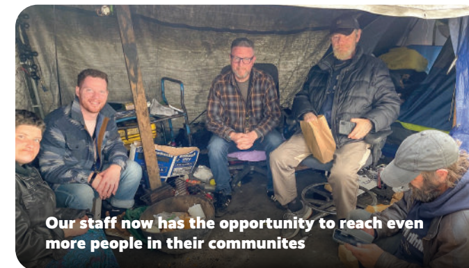
Our staff now has the opportunity to reach even more people in their communities