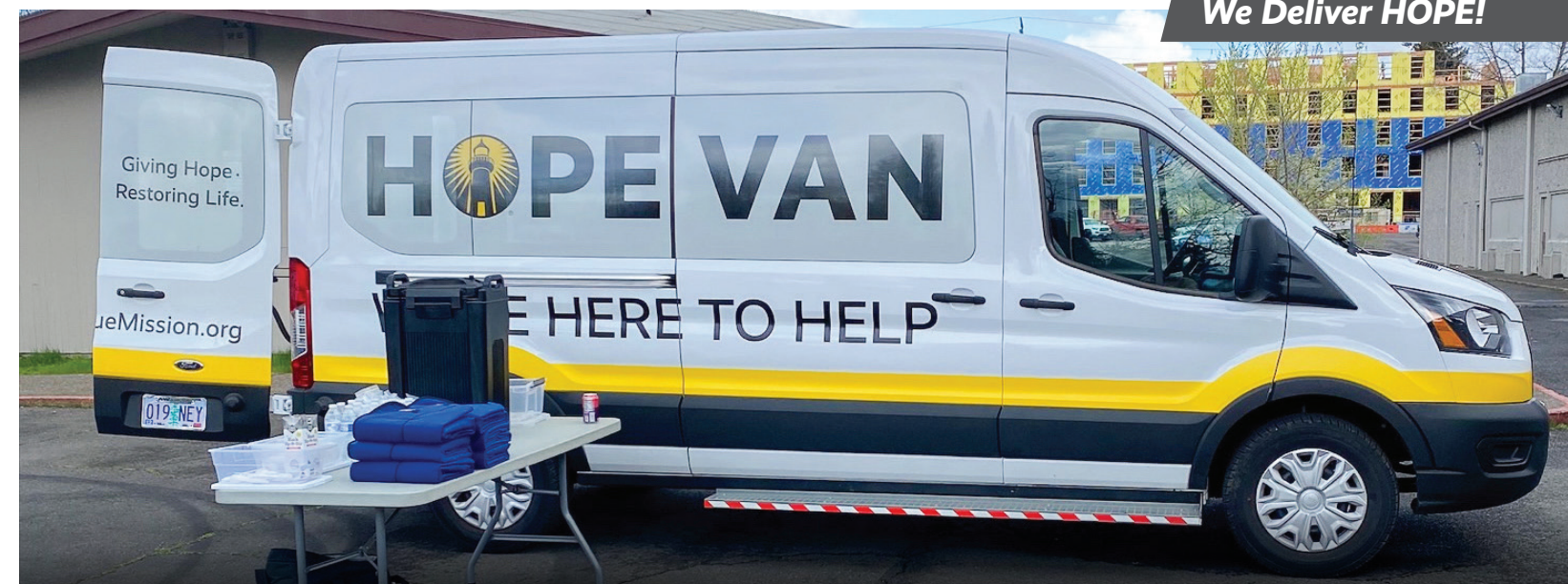
We Deliver HOPE!

Please donate today to provide meals, shelter, and life-restoring care to neighbors in need. www.PortlandRescueMission.org/FallNL