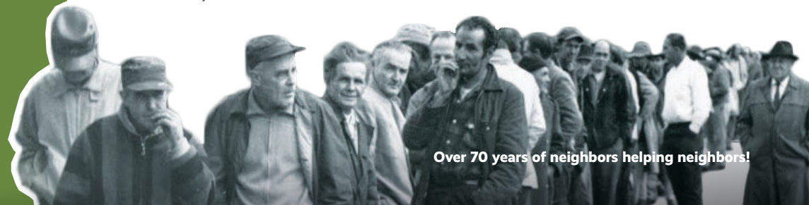
Over 70 years of neighbors helping neighbors!